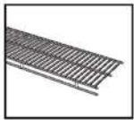
25.4cm/ 10" depth